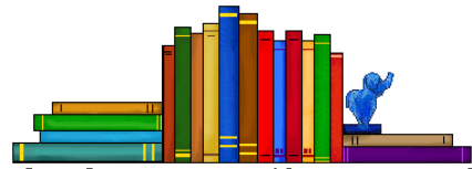
Check Out a Library Book

The Lending Library is available online. Visit the Lending Library book check-out tab on our PFEC website. Complete the google form to check out a book and we will send it home in your child's backpack.